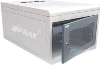
7U Rack with 750mm depth

Customized Racks and Open-Frame Racks offer tailored solutions for specific infrastructure needs.