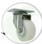
Heavy-Duty Castor Wheels