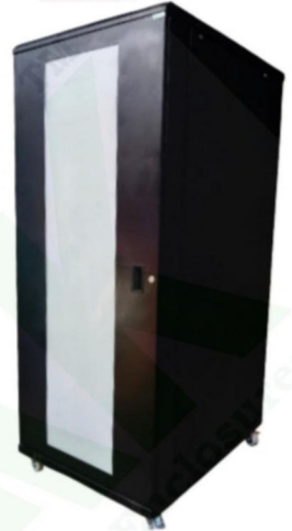
ZIP 42U 800 x 1000 Server Rack