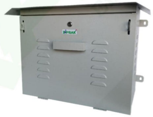
Ziprak Outdoor Junction Box