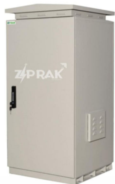
ZIP 24U O/D Rack