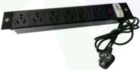
PDU 6 Sockets 6/16 Amp