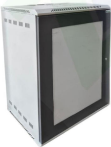
ZIP 15U Rack

Ziprak Wall-mount racks are a practical solution for keeping network equipment organized, secure, and easily accessible.