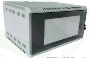
ZIP 6U Rack