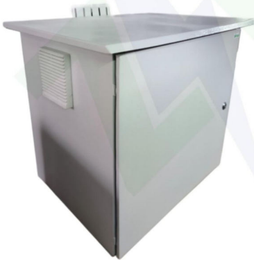
ZIP 12U O/D Rack