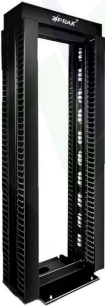
ZIP 42U Open-Frame Rack