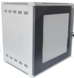
ZIP 12U Rack