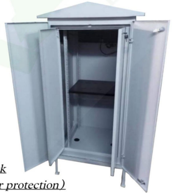
ZIP 24U O/D Rack (With Double door protection)

Both customized and open-frame racks cater to diverse infrastructure requirements, offering flexibility, efficiency, and reliability.