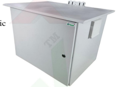
ZIP 9U O/D Rack