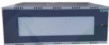
ZIP 4U ECO Rack

Ziprak ECO Racks are a sleek and practical solution for managing network equipment in tight spaces. By utilizing vertical wall space, these racks help keep floors and shelves clear, reducing clutter and improving airflow. They're perfect for: