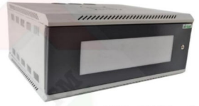
ZIP 4U Rack