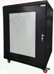
ZIP 15U FS Rack

Floor-standing racks are ideal for data centers, server rooms, and network closets, providing a reliable and scalable solution for managing complex network infrastructure.