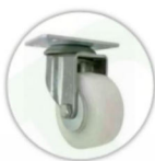
Heavy-Duty Castor Wheels