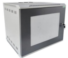
ZIP 9U Rack