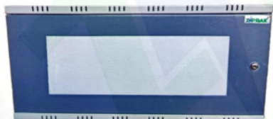
ZIP 6U ECO Rack